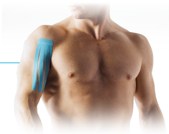
SMALL FAN SPIDER