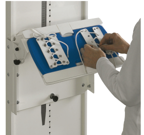
shown with shoe and boot lace board